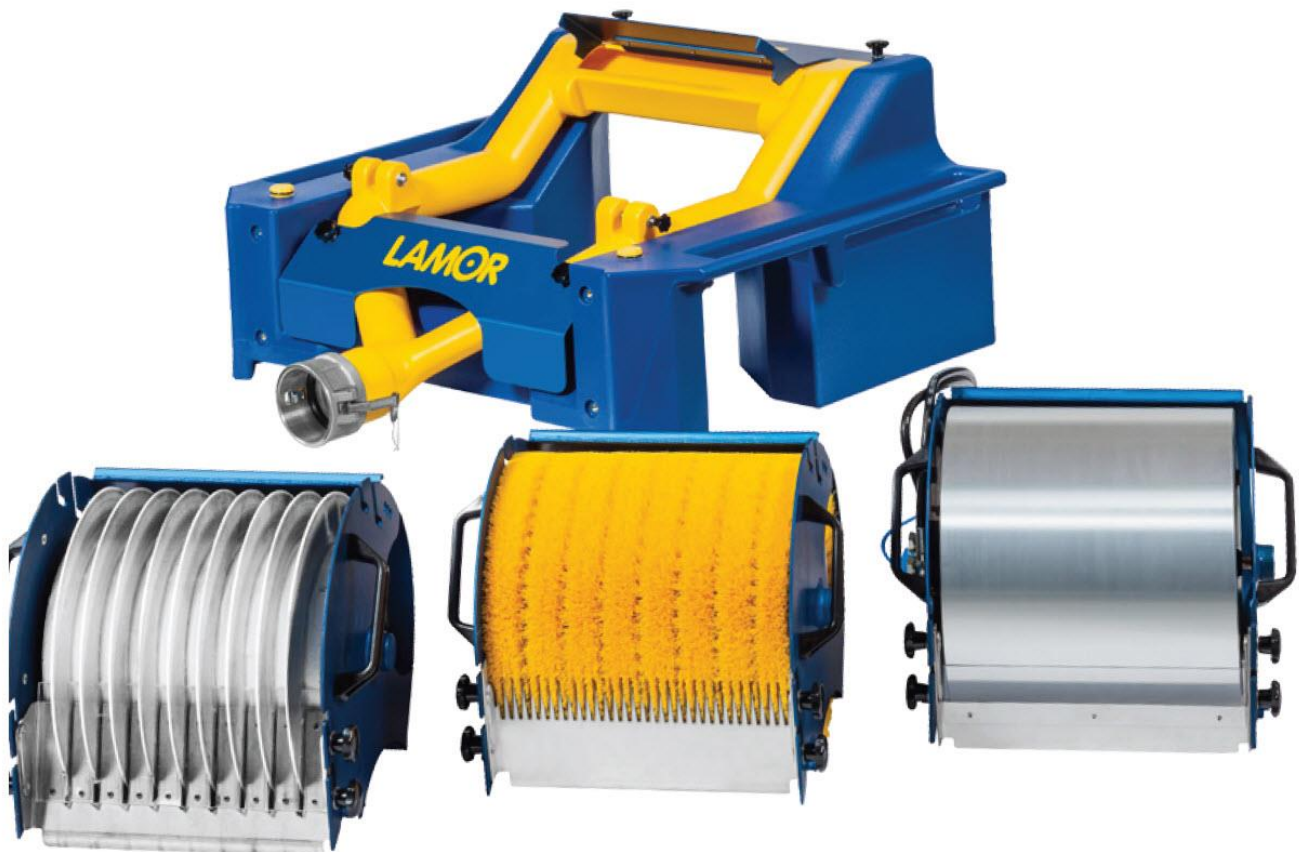
Minimax 25 skimmer head options.